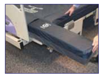
Removable foot and side bolsters