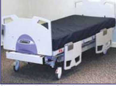
Shown in smallest configuration.

BariMatt 1000 Plus mattress and bed compatibility 36"W x 80"L x 6.5"D 42"W x 80"L x 6.5"D