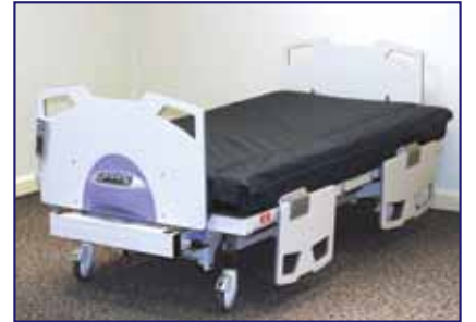
Shown with 6" expansion panel inserted.