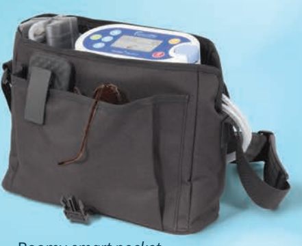
Roomy smart pocket for personal items.

Opening at the back of the case allows power cord access in any location.