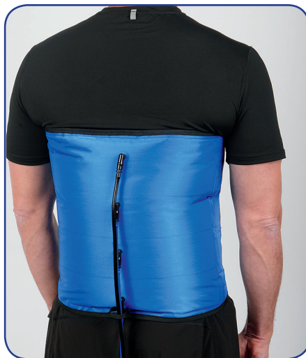
BioCryo Back GC-3035-B