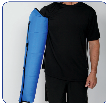
BioCryo Full Arm GC-3035-L (Available in S/M/L)