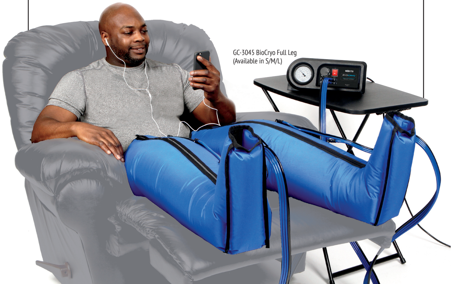
GC-3045 BioCryo Full Leg (Available in S/M/L)

Recover Faster Cold Compression Made Easy