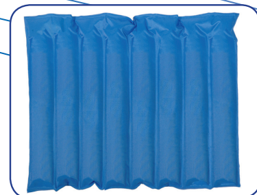
BioCryo Gel Insert CP-S/M/L

Our BioCryo gel inserts are latex free and made of high quality 200 Denier coated oxford nylon fabric with 3 mils of polyurethane. These uniquely designed inserts flex and conform to any extremity, delivering cold compression without having to add or pump ice water to the garment. These inserts are to be used inside our standard, adjustable, and custom garments.