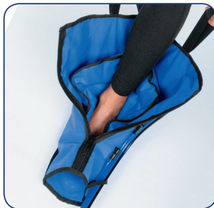
BioCryo Ankle GC-3045-A