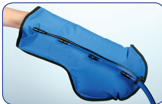
BioCryo Hand/Wrist GC-3035-H-W