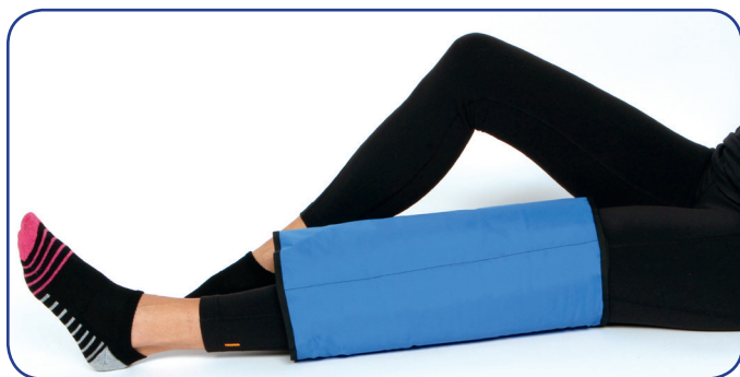
BioCryo Knee GC-3045-KC