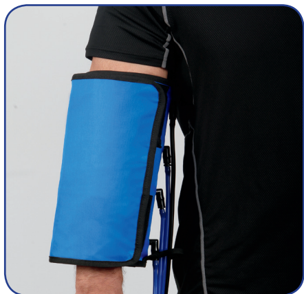
BioCryo Elbow GC-3035-EC