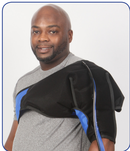
BioCryo Shoulder GC-3035-SH-C