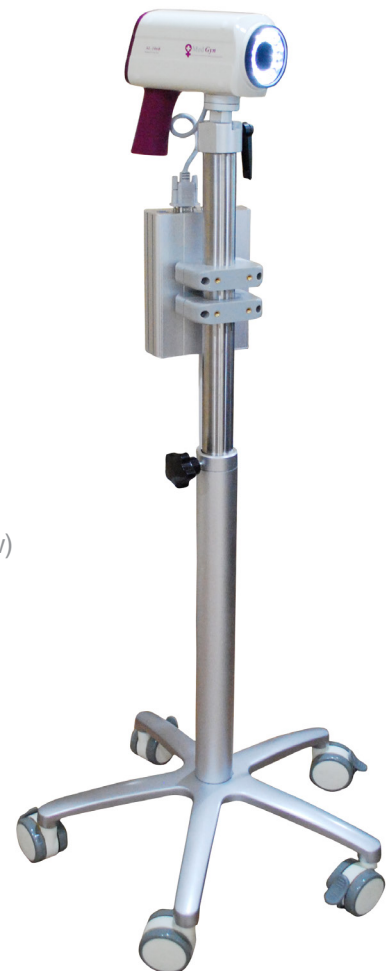
AL-106 BWL Rolling Base