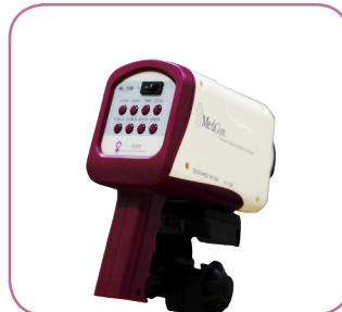
AL-106 BWL (Back view)