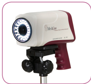
AL-106 BWL (Front view)

Different from traditional optical colposcopes, the AL-106 BWL is a digital colposcope that is battery operated with wireless functionality. The colposcope has an LED light source to ensure ultra-bright visualization and a long life cycle. Its unique optics provide multiple filters to ensure high quality images and improved visualization of blood vessels.