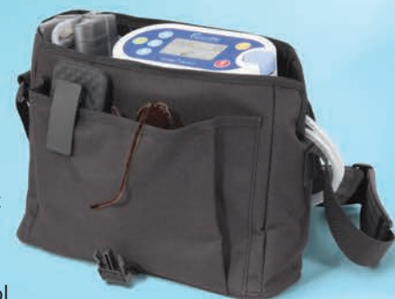
Roomy smart pocket for personal items.

Every WoundPro control unit comes with a lightweight and very handy carrying case. The case allows the mobile patient to enjoy freedom of movement and can be used to hang from a wheelchair. With a handy opening in the back, the control unit can also be charging the batteries while in the case.