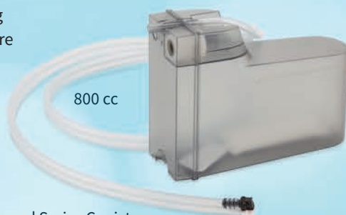
Advanced Series Canisters with Sure-Lock Connectors