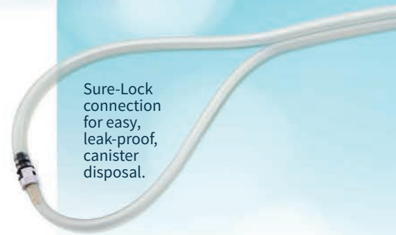
Sure-Lock connection for easy, leak-proof, canister disposal.