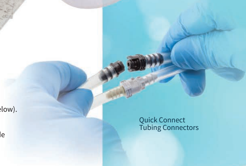
Quick Connect Tubing Connectors