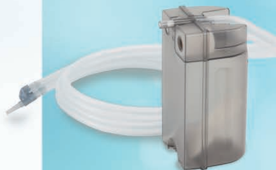
Basic Series Canister