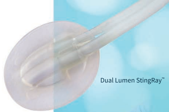
Dual Lumen StingRay™