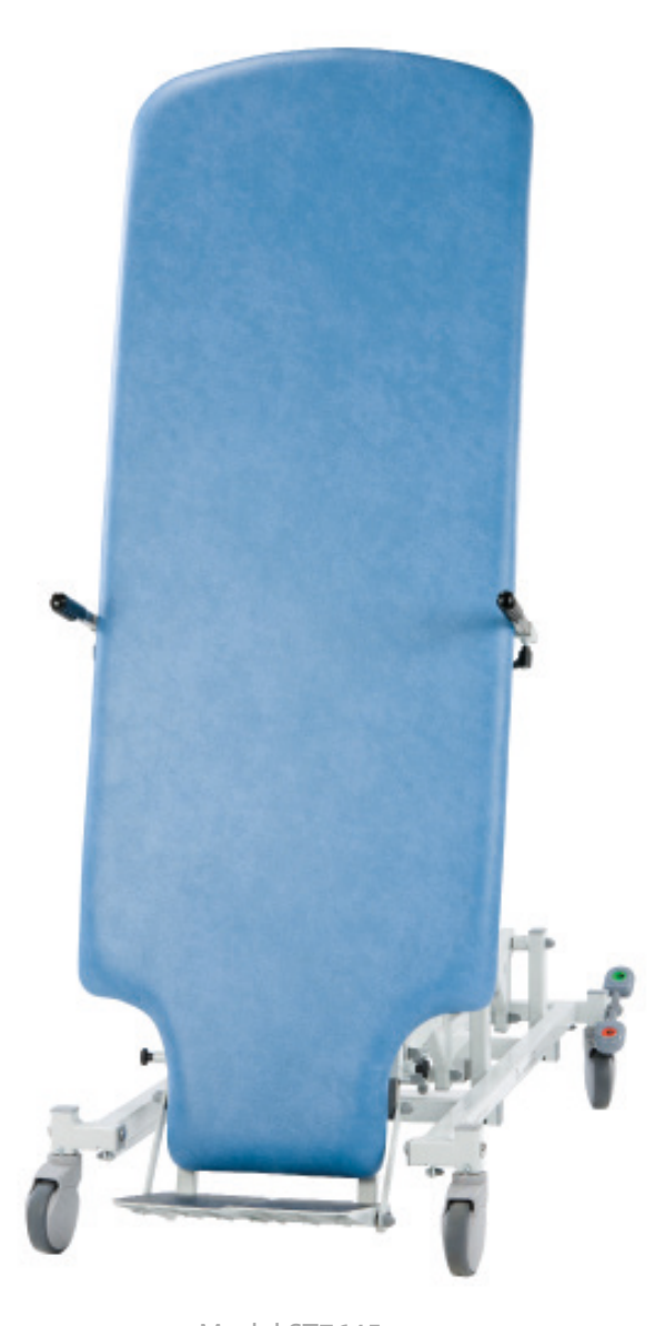
Model ST7645 Colour Sky Blue