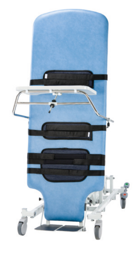
Set of harnesses & worktable included as standard