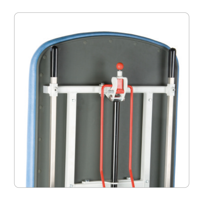
Emergency Override fitted on all models

ST7645 Tilt Table Pro - Single Leg ST7645DL Tilt Table Pro - Divided Leg