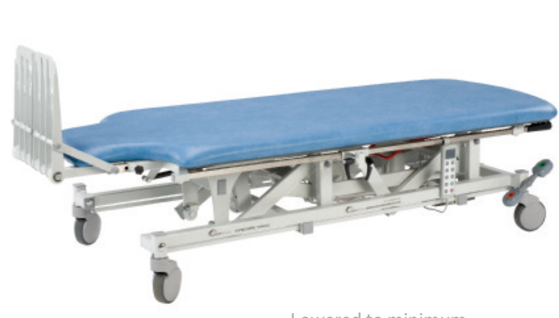
Lowered to minimum height for patient transfer