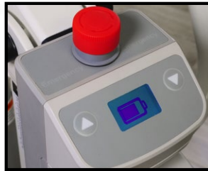
LCD battery level display; audible low-battery indicator