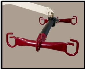
6-point spreader bar maximizes sling options