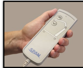
2-button pendant with LED indicator