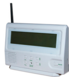
TL-4015 Central Monitor Displays Which Resident/Device Triggered Alert