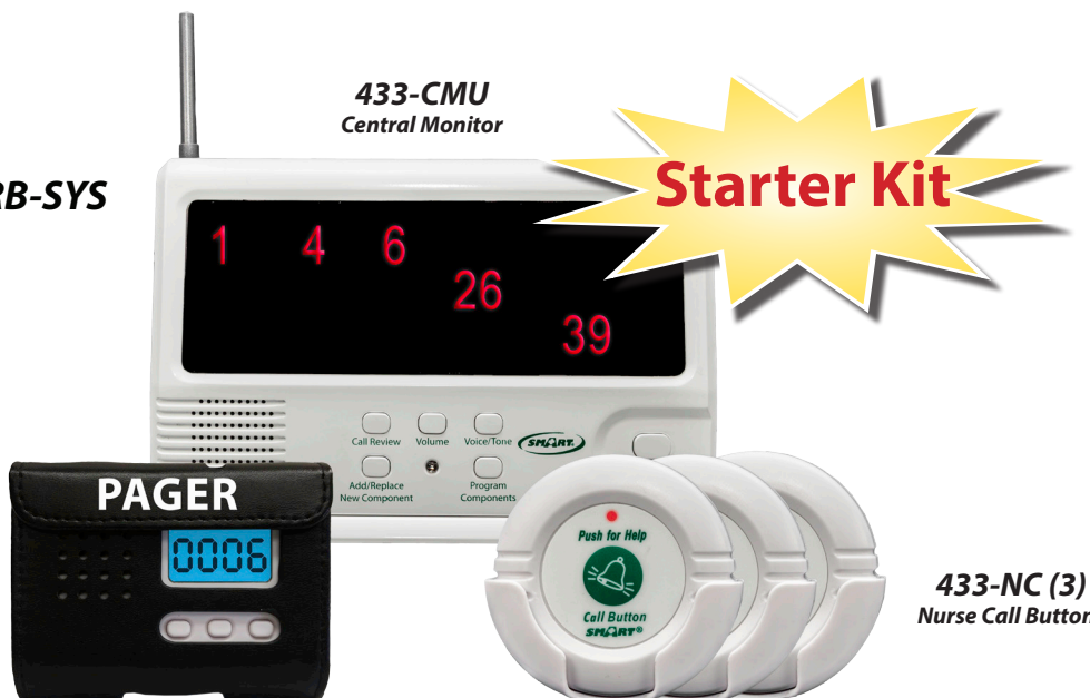
433-PRB Caregiver Pager w/ Reset Button