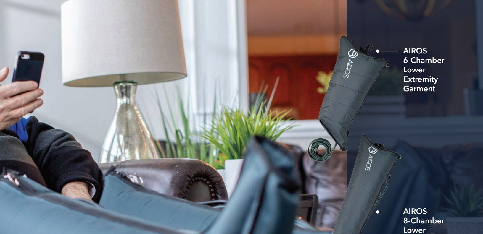
AIROS 6-Chamber Lower Extremity Garment