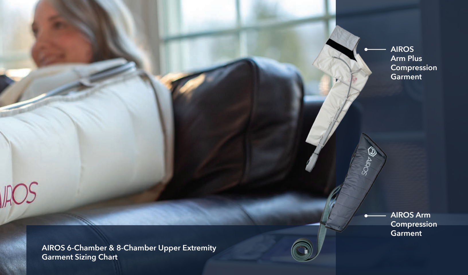
AIROS Arm Plus Compression Garment