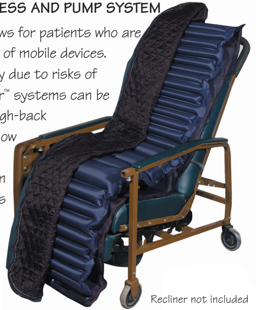
Recliner not included